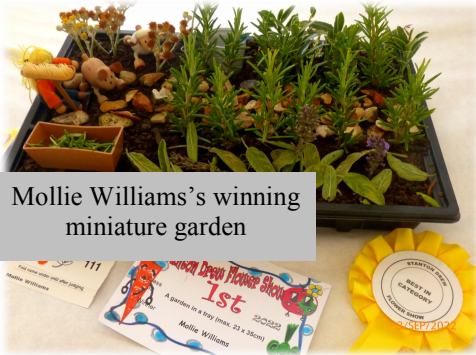
Mollie Williams's winning miniature garden