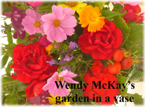
Wendy McKay's garden in a vase