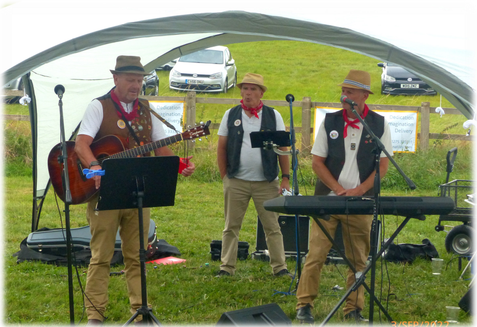
Always welcome at the flower show The Twerzels—Ooh Aar