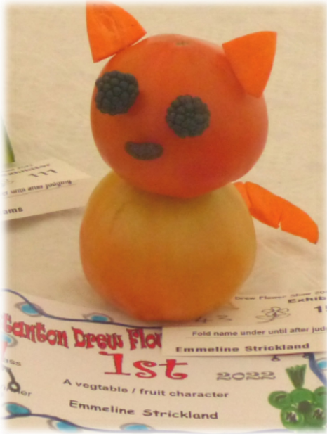
Emmeline Strickland's winning vegetable / fruit character