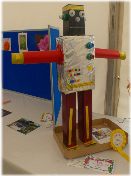
Poppy Marsh's winning model made from recycled materials.